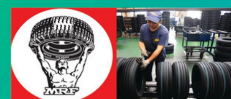
MRF Manufacturer Unit