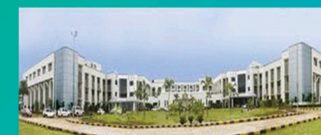
District Headquarters Sangareddy