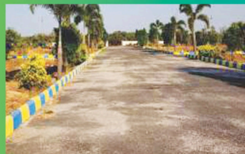
40' MAIN ROAD & 30' BT ROADS