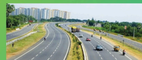
Hyderabad - Mumbai NH 65