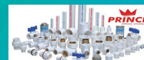
Prince PVC Pipes