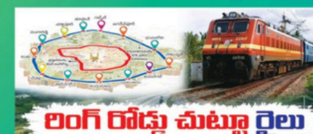
Rail Ring Project