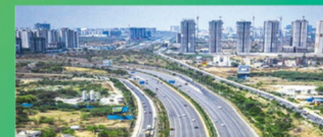
Outer Ring Road (ORR)