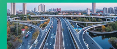
Regional Ring Road (RRR)