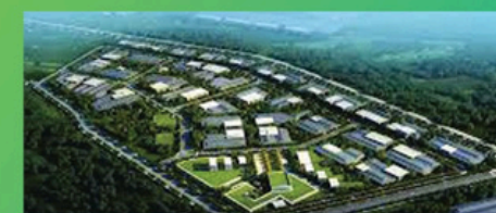
NIMZ (13500 Acres)