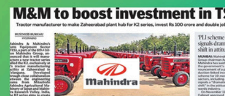
Mahindra Tractor at Zaheerabad